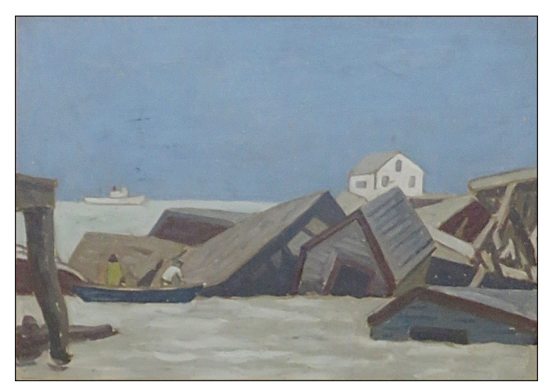
Leading the sale at $11,400 was Ross Moffett's "Hurricane of 1938.