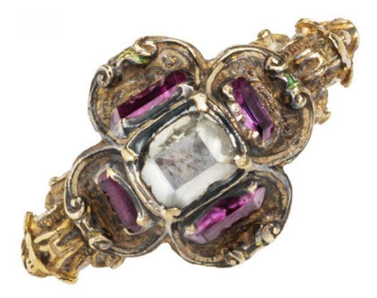
TABLE: The Guilhou Renaissance table cut diamond, Western Europe, 16th century. The prestigious combination of a diamond with rubies, forming the raised quatrefoil bezel, unites two powerful talismans, and their protective powers or virtue are referred to by John Lyly, The Anatomy of Wit (1578): "is not the diamond of more valew than the Rubie because he is of more virtue?" It was treasured by two of the most important collectors of rings in the 19th and 20th centuries.

As another example, he indicates a brooch with rose-cut diamonds. The rose cut came into being when cutters learned how to put facets on top of a table cut. Composed of white, greenish-yellow, slightly pinkish and brown diamonds, this brooch ranks as one of the rare examples of multiple colored diamonds featuring in a single piece of jewelry from the 17th century.