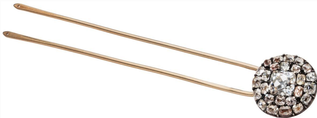
"THE BRILLIANT CUT: The St. Alban's Bodkin: An ornamental hairpin. The back is inscribed in italics, 'The Gift of Charles 2nd to Nell Gwynne'. This historic jewel is part of a group given by King Charles II of England (reigned 1660–1684) to his Welsh mistress, Nell Gwynne (1650–1687) and inherited by their illegitimate son, Charles Beauclerk, created 1st Duke of St. Albans (1670–1726" LES ENLUMINURES