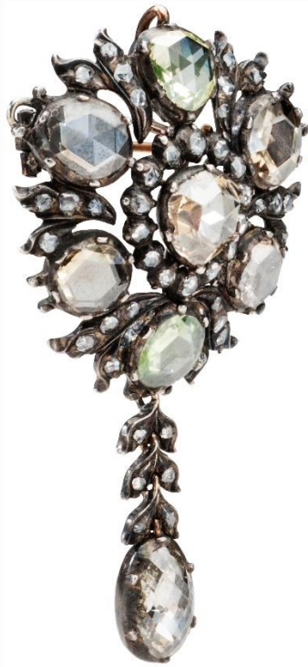
"THE DUTCH ROSE JEWEL: Western Europe, The Netherlands, Early 18th Century is set with colored (grey, greenish, and brownish-yellow) rose-cut diamonds, the effect deriving from the subtle rainbow shimmer of the 'almost fancy stones'. Of this early date, virtually no other colored diamond jewels are known except within the French royal circle." LES ENLUMINURES