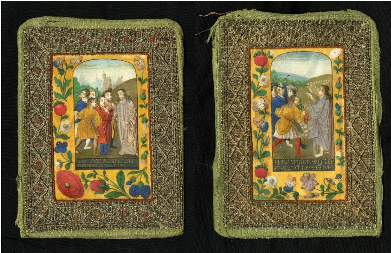
Figure 3 Masters of the Suffrages a. Christ Drives out the Devils b. Christ Curing the Blind and Mute Northern Netherlands, probably Leiden, c. 1510

Please contact us for high resolution images and descriptions of the featured work of art.