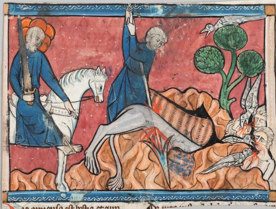
Figure 4 Master Burckhardt-Wildt Apocalypse The Divine Warrior Battling the Beast France, Lorraine, c. 1290

Please contact us for high resolution images and descriptions of the featured work of art.