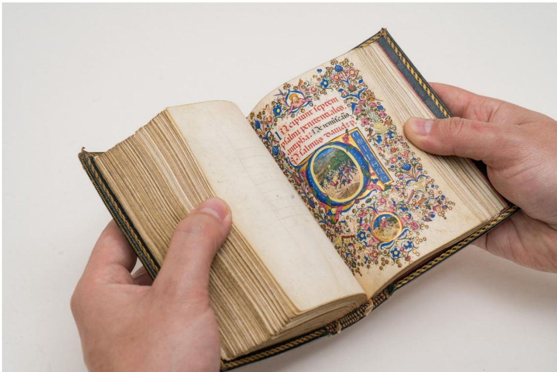
Figure 1 Book of Hours, Use of Rome [Florence, c. 1460-75] In Latin, illuminated manuscript on vellum 19 historiated initials by Francesco di Antonio del Chierico (1433-1484) 282 leaves (10 blank), 126 x 86 mm (BOH-0260)

Please contact us for high resolution images and descriptions of the featured work of art.