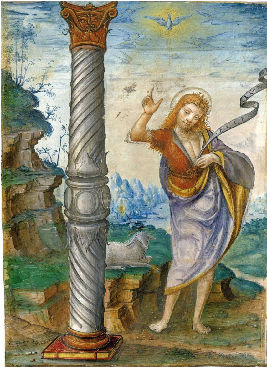
Figure 5 Master B.F. Saint John the Baptist, in an Initial 'I' from a Choir Book Italy, probably Lodi, c. 1500–1510

Please contact us for high resolution images and descriptions of the featured work of art.